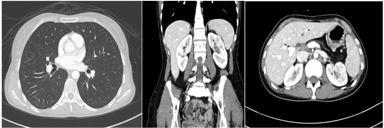
Figure 2: CT chest and abdomen after treatment