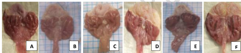
Fig. 1 – Images of preliminary studies: A = 12.5mg/kg; B = 25mg/kg; C = 50mg/kg; D = 100mg/kg; E = 200mg/kg; F = 400mg/kg