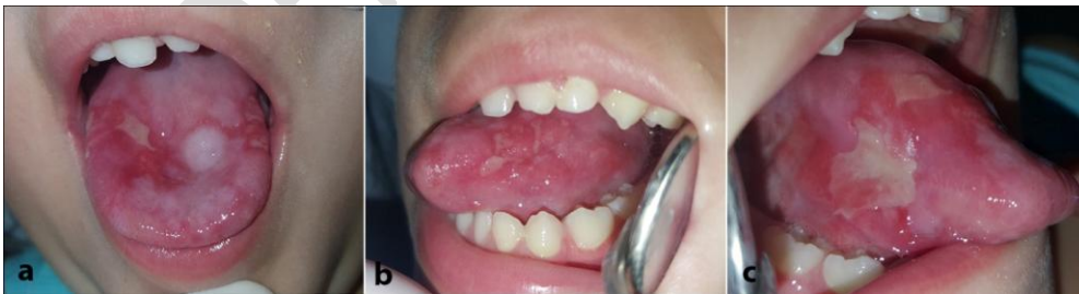
Figure 1: Clinical examination. Diffuse erosions and ulcerations with peripheral atrophy and erythema and limited whitish papule-like and striated lesions, located: a) on the dorsum, b) left lateral border and c) right lateral border of the tongue.