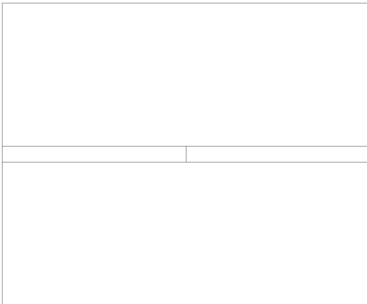
Figure 2. Effect of interaction between canopy heights and planting densities on Zn, Cu, Fe and Mn content (A) On rainy season fruit (B) On winter season fruit.

1.41%) were noted in treatment combination H1D2 while the Zn, cu, Fe and Mn (2.11%, 2.00%, 2.28% and 1.07%) were documented highest in H3D2 in rainy season crop. The minimum micro-nutrient for both seasons was noted in H4D3.