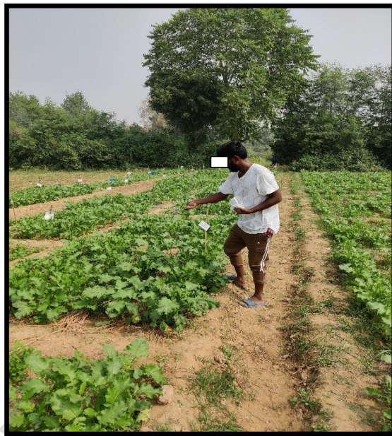
Image 4 : The Recommended Dose of Fertilizer (80:40:40 NPK kg/ha) will be applied, as Half dose of Nitrogen along with full dose of Phosphorus, Potassium and Sulphur as basal and remaining half dose of Nitrogen after 30 Days of Sowing (DAS).