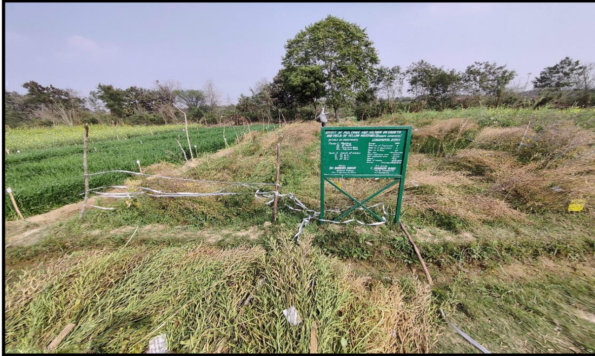
Image 5 : Harvesting in Experimental field at Crop Research Farm during Rabi season, 2021-22