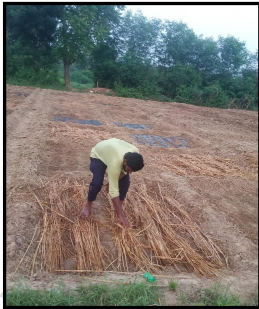
Image 2 : Arrangement of Paddy straw mulch in experimental field at Crop Research Farm.