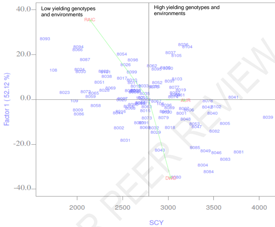
Figure 1. AMMI I biplot based on seed cotton yield over main principal component (IPCA 1) values.