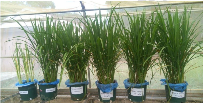
Plate1: Rice response to applied guano from Kisarawe cave A (BGK-A) in reproductive stage: from absolute control, 0, 10, 20, 40 and 80 mg/Kg P under screen house condition