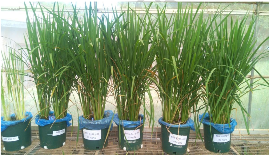
Plate3: Rice response to applied guano from Sukumawera cave (BGS) in reproductive stage: from absolute control, 0, 10, 20, 40 and 80 mg/Kg P under screen house condition