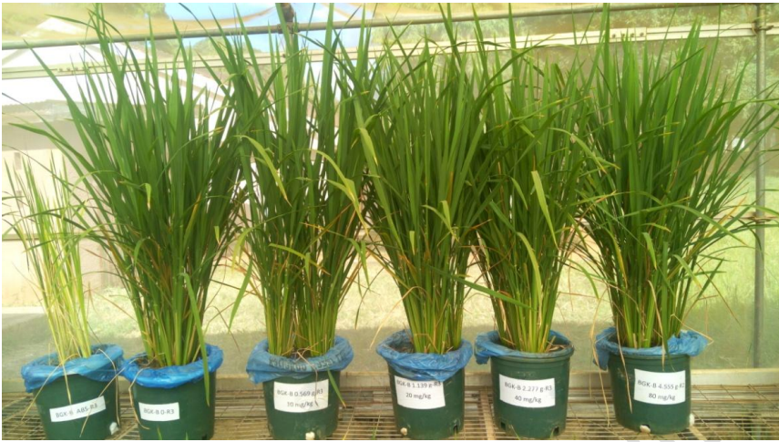
Plate2: Rice response to applied guano from Kisarawe cave B (BGK-B) in reproductive stage: from absolute control, 0, 10, 20, 40 and 80 mg/Kg P under screen house condition