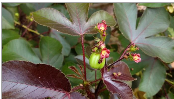
Figure 1: Leaf, fruit and flowers of Jatropha gossypifolia L.

The fruits are oblong capsules with 3 compartments that can be seen from the outside. Once reached maturity, the fruit explodes by projecting its seeds to more than 3 meters. They can thus grow not far (autochory), or be carried by the animals (zoochory). The species is very resistant because the seeds can remain viable in the ground during 10 years, and their germination can be encouraged by the fires.