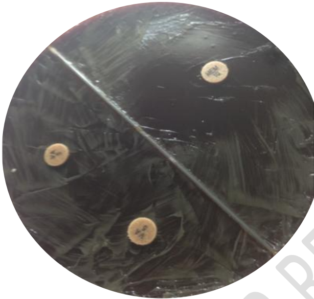
Figure 4: Antibiotic susceptibility test for the isolated Brucella spp. to meropenem (MEM; zone of inhibition diameter >30 mm) and vancomycin (VA; no zone of inhibition).