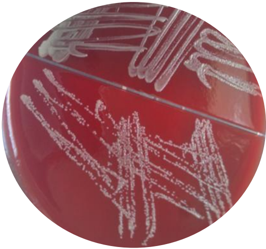
Figure 1: Three days old blood agar plate shows the colonies of Brucella strain isolated from the patient's blood sample.