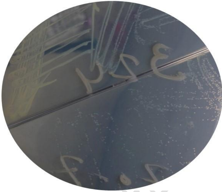
Figure 3: Three days old Mueller-Hinton agar plate shows a growth of the isolated Brucella spp.