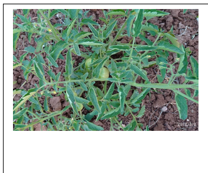
Fig 1. SL CBE G 26