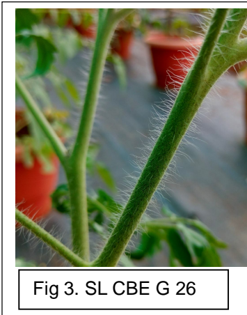
Fig 3. SL CBE G 26