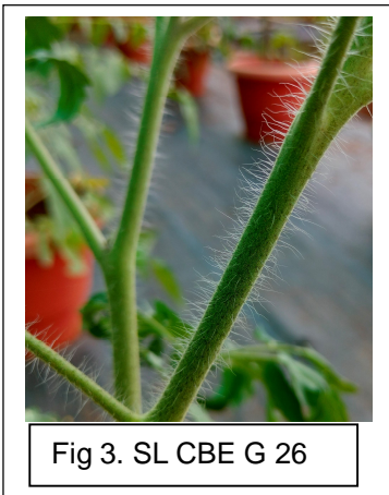
Fig 3. SL CBE G 26