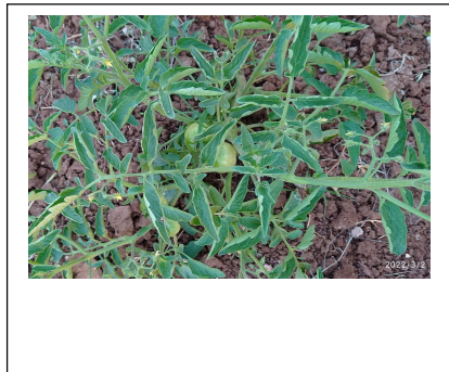
Fig 1. SL CBE G 26