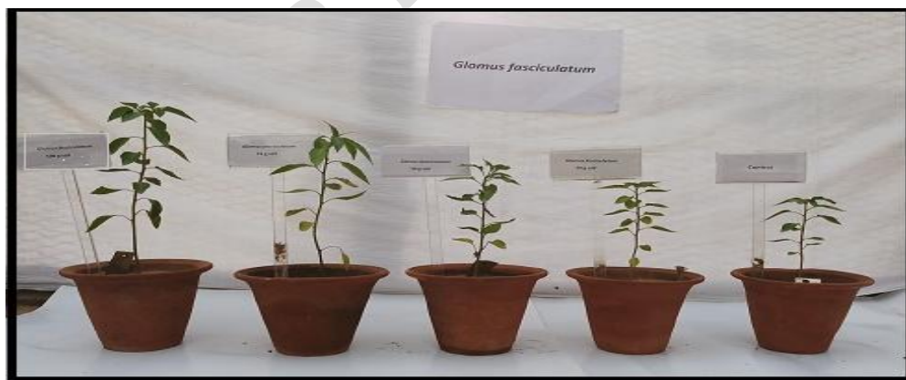
Fig:2 Effect of different doses of mycorrhiza on plant height

The present study was done with the objective of best dose of mycorrhization in Capsicum annum plants. A pot experiment was conducted in screen house of Plant Pathology, CCS HAU, Hisar, to see the effect of Glomus fasciculatum with different doses. Mycorrhizal colonization in roots and number of sporocarps in soil was calculated at 30, 45, 60 and 90 days after transplanting. Plant height, root length, dry weight of root and shoot and SPAD chlorophyll content at 30, 45, 60 and 90 days after transplanting were recorded. Nutrient content (NPK) at 90 days after transplanting was calculated.