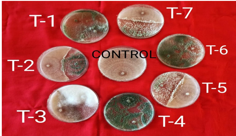
Plate 1: In vitro evaluation of bio control agents against growth of R. solani