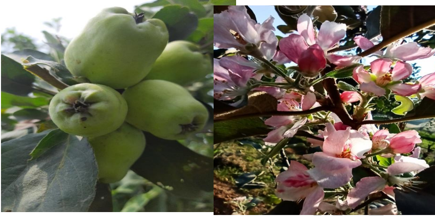
Fig 1- Apple flower and fruit