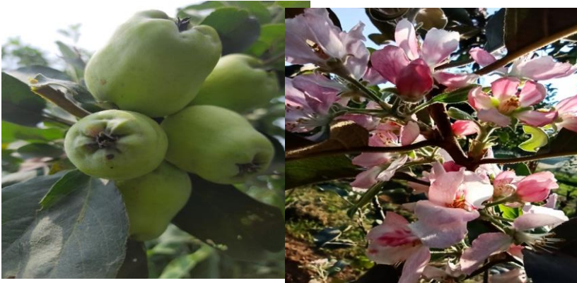
Fig 1- Apple flower and fruit