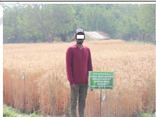
Figure b. Wheat crop at harvest stage