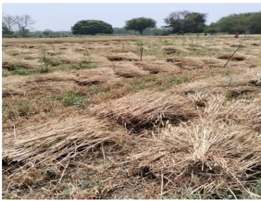
Figure c. Harvested wheat crop