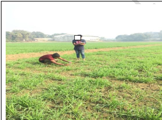
Figure a. Measuring plant height of wheat crop