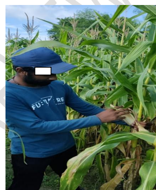
Figure 5 Harvesting