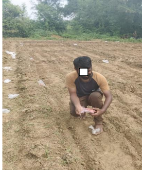
Figure 2 Sowing