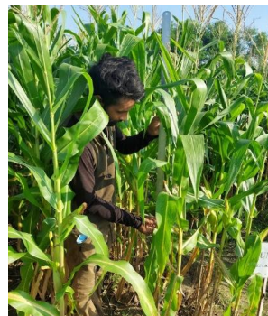
Figure 3 Taking readings