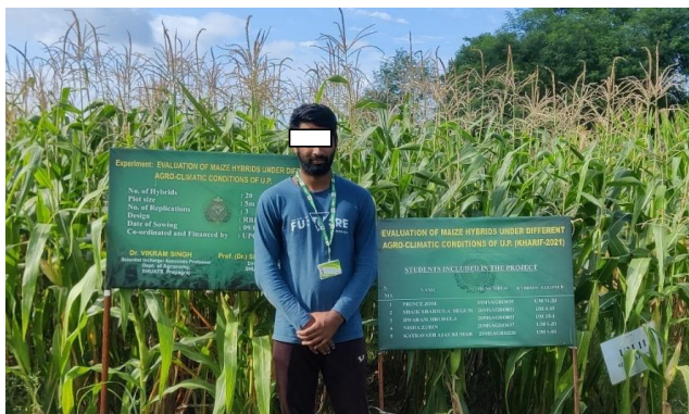
Figure 4 Photo with Treatment Details