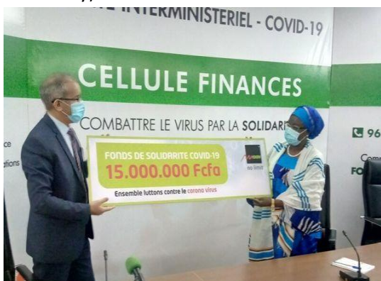
Picture 3. Moov Niger Monetary assistance to fight against COVID-19.