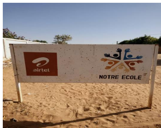
Picture 2. Primary school built by Airtel Niger