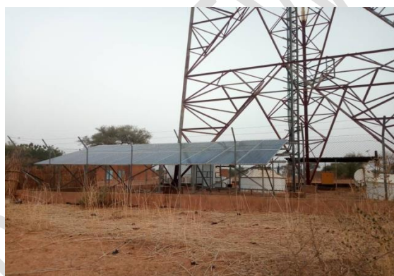
Picture 4. Orange Niger Solar energy in the commune of Dantchandou).