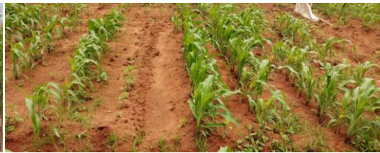
Pic 9 Maize + pigeon pea at 1:4 ratio sown in ridge and furrow methodMaize + pigeon pea at 1:4 ratio sown in flatbed fb making conservation furrow at 25 DADS