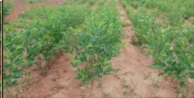
Pic 6 Sole pigeon pea sown in flat bed method