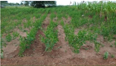
Pic 7 Sole Pigeon pea sown on flatbed fb making conservation furrow at 25 DAS