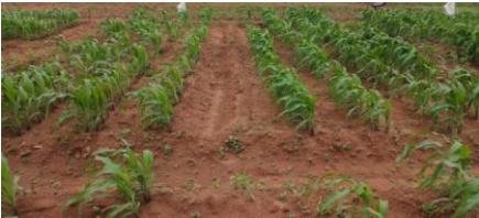
Pic 5 Sole maize crop sown in flatbed fb making conservation furrow at 25 DAS