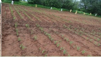
Pic 2 Sole maize crop sown in flat bed method