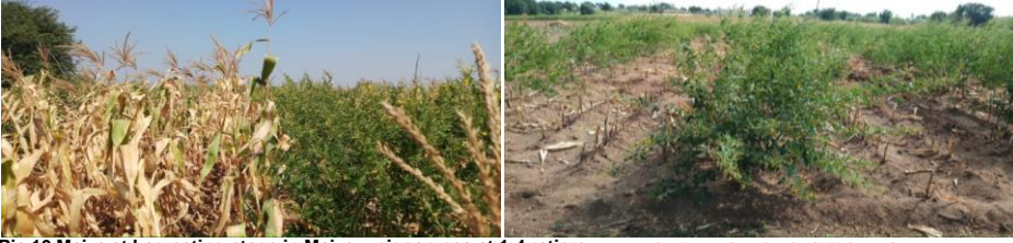
Pic 10 Maize at harvesting stage in Maize + pigeon pea at 1:4 ratio Pigeon pea after harvesting of maize in Maize + pigeon pea at 1:4 ratio