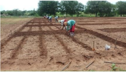
Pic 1 Sowing in flatbed