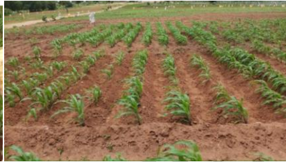
Pic 4 Sole maize crop sown in flatbed fb making ridges at 25 DAS