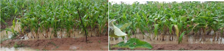
Pic 11 Water conservation in ridge and furrow method