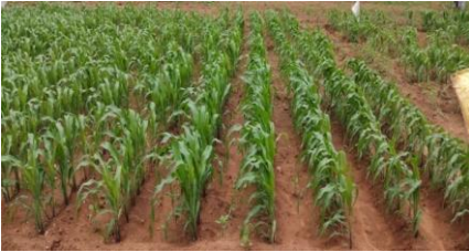
Pic 3 SoleMaize crop sown in ridge and furrow method