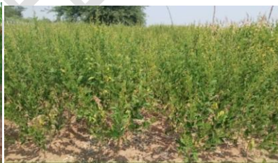
Pic 8 Sole Pigeon pea sown in ridge and furrow method