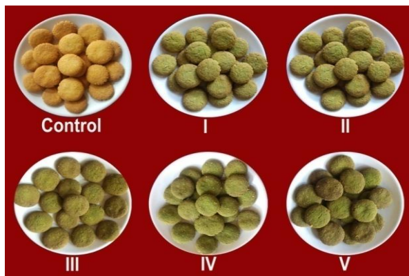
Fig 1: Nutritional evaluation

Comment [Ma2]: Reference of recipe if any