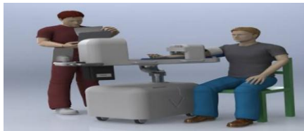
Fig.3. Veebot robot drawing blood from a patient [33]