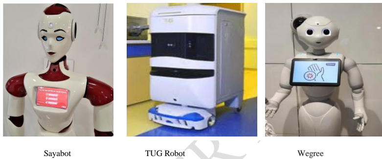
Fig. 2. Some robots that help to contain the spread of infectious diseases [30, 31, 32]