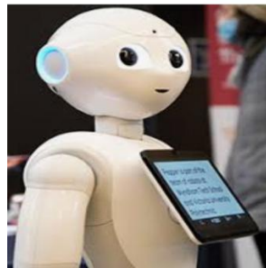
Fig. 5. Pepper robot encouraging people to be vaccinated at Victoria University [38]