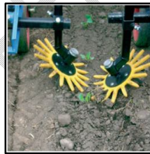
Fig 2: Finger weeder uses rubber spikes that are pointed at an angle towards the crop (Weide et al. 2008)

The finger weeder is a simple mechanical intra-row weeder. That uses two sets of steel cone wheels to which rubber spikes or “fingers” are a fixed. The fingers point horizontally outward at a certain angle and operate from the side and beneath the crop row with ground-driven rotary motion (Fig.2). The rubber fingers penetrate the soil just below the surface to remove small weeds. The finger mechanism performs best in loose soil and poorly in heavily crusted, compacted soils or where heavy residue is present. This type of weeder is effective against young weed seedlings up to 2.54 cm (1 in.) tall and interacts easily with well-rooted crops. The recommended operating depth is 12.7 mm (0.5 in.) to 19.1 mm (0.75 in.). The recommended forward speed to use with this weeder is 4.8 km/h to 9.7 km/h (3–6 mile/h). Alexandrou (2004) reported the finger weeder and obtained weed efficacy results of 61 % of the intra-row weeds killed in organic corn. A disadvantage, is that the tractor must be steered very accurately so that the finger mechanism can work as close as possible to the crop rows (Bowman 1997; Cloutier et al. 2007; Weide et al. 2008).