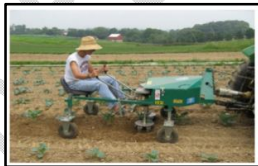
Fig.3: ECO weeder requires an operator to move rotating weeding mechanisms with tines (HCC, 2011)

The ECO-weeder is an intra-row weeder that is three-point hitch mounted on tractor. It is driven by the power takeoff (PTO) of the tractor to drive a belt system that powers two discs with tines (Fig.3).