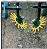
Fig 2: Finger weeder uses rubber spikes that are pointed at an angle towards the crop (Weide et al. 2008)

The finger weeder is a simple mechanical intra-row weeder. That uses two sets of steel cone wheels to which rubber spikes or “fingers” are a fixed. The fingers point horizontally outward at a certain angle and operate from the side and beneath the crop row with ground-driven rotary motion (Fig.2). The rubber fingers penetrate the soil just below the surface to remove small weeds. The finger mechanism performs best in loose soil and poorly in heavily crusted, compacted soils or where heavy residue is present. This type of weeder is effective against young weed seedlings up to 2.54 cm (1 in.) tall and interacts easily with well-rooted crops. The recommended operating depth is 12.7 mm (0.5 in.) to 19.1 mm (0.75 in.). The recommended forward speed to use with this weeder is 4.8 km/h to 9.7 km/h (3–6 mile/h). Alexandrou (2004) reported the finger weeder and obtained weed efficacy results of 61 % of the intra-row weeds killed in organic corn. A disadvantage, is that the tractor must be steered very accurately so that the finger mechanism can work as close as possible to the crop rows (Bowman 1997; Cloutier et al. 2007; Weide et al. 2008).