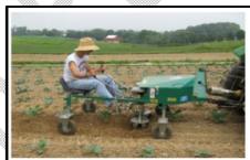
Fig.3: ECO weeder requires an operator to move rotating weeding mechanisms with tines (HCC. 2011)

The ECO-weeder is an intra-row weeder that is three-point hitch mounted on tractor. It is driven by the power takeoff (PTO) of the tractor to drive a belt system that powers two discs with tines (Fig.3).