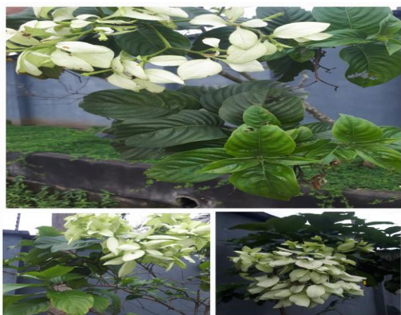
Figure 1: Mussaenda philippica in its natural habitat

Comment [DK5]: This figure is not well presented