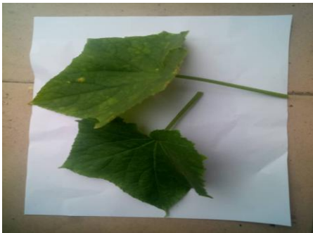
Fig 5a: C. mannii showing no symptom of infection

Trichoderma harzianum , a fungus reported to be effective as a biocontrol agent for virus pathogens was inoculated into the roots of young seedlings of C. mannii and immediately followed by inoculation with virus inocula on leaves of the same plant while a second pot was inoculated with virus inocula only. The results obtained after three weeks of inoculation revealed that plant inoculated with the combination of Trichoderma harzianum and virus inocula showed no symptoms and tested negative to RT-PCR (Fig 5a) while plant inoculated with virus inocula only revealed symptoms of rugosity and mottling and tested positive to RT-PCR (Fig 5b).