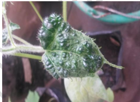
Fig 5b: Severe rugosity and mottling on C. Mannii