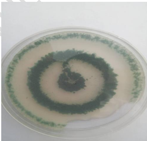
Fig 1: Colonies of Trichoderma harzianum

Soil samples collected from University of Calabar piggery farm in polyethylene bags were picked up with spatula and dropped in the plates containing PDA solution and labelled accordingly. The inoculated plates were incubated at room temperature of 27\pm 1^{\circ}\text{C} and daily observations were made for emergence of fungal colonies. Colonies formed were subculture to obtain pure cultures of the isolates (Fig 1).