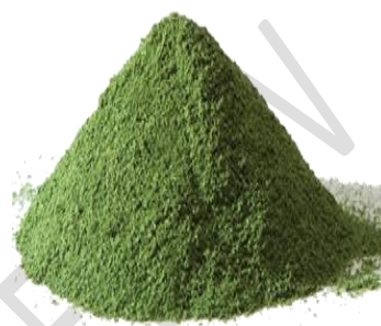
1b. Moringa oleifera leaf meal.