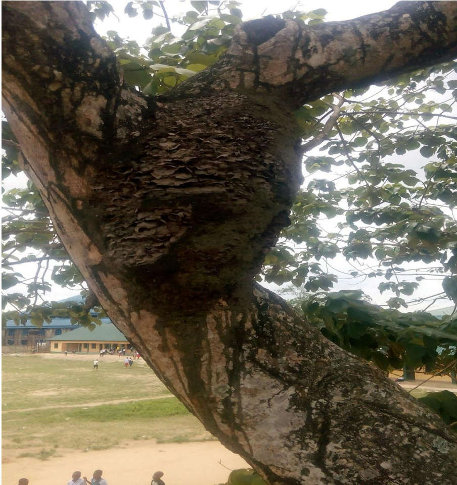
Fig:4 Gmelina arborea (tree) with Microcerotermes annandalei nest