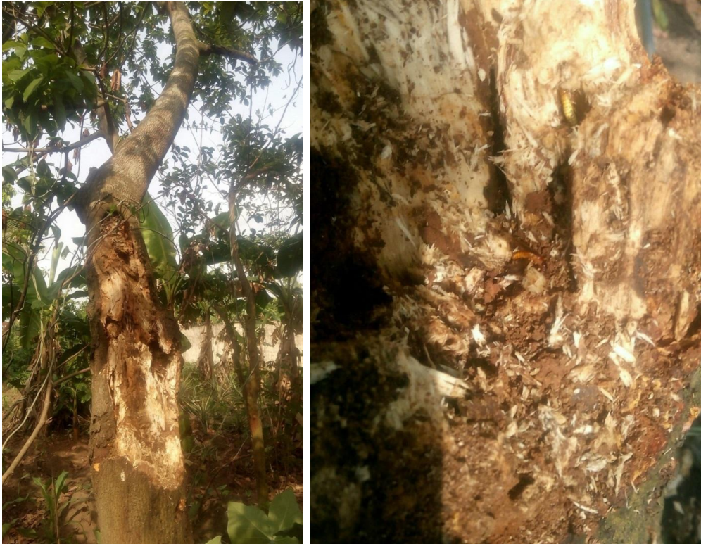
Fig 3 Persea americana showing Schedorhinotermes medioobscurus infestation using hollow sound of the tree