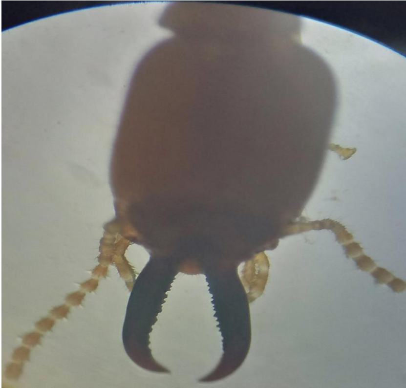
Fig 2. Head of soldier of Microcerotermes paracelebensis