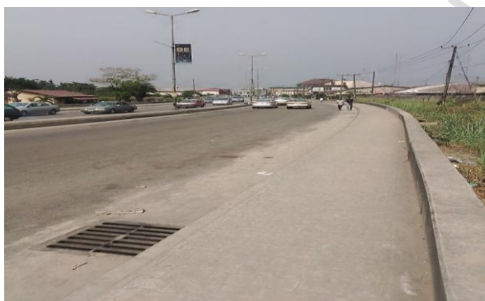
Figure 2: Trans-Amadi Road, an Improved Road Infrastructure