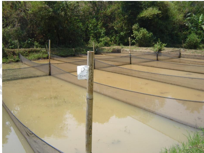
Figure 1. Fish pond cultured

This research was conduct in Ciparanje Pond, Faculty of Fisheries and Marine Sciences, Universitas Padjadjaran and the forage analysis laboratory, Faculty of Animal Science, Padjadjaran University.