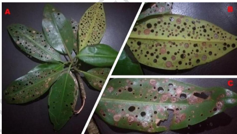
Figure 2. Leaf spot infected R. apiculata leaves (A) infected twig (B) ventral side of the infected leaf (C) dorsal side of infected leaf

The infected R. apiculata trees were found thriving in these highly polluted waters and within the residential populace. The plant pathology experts confirmed based on the morphological characteristics of the fungus present in R. apiculata , that the fungus was leaf anthracnose that is caused either by filamentous fungi in the genus Colletotrichum or Gloeosporium (Figure 2).