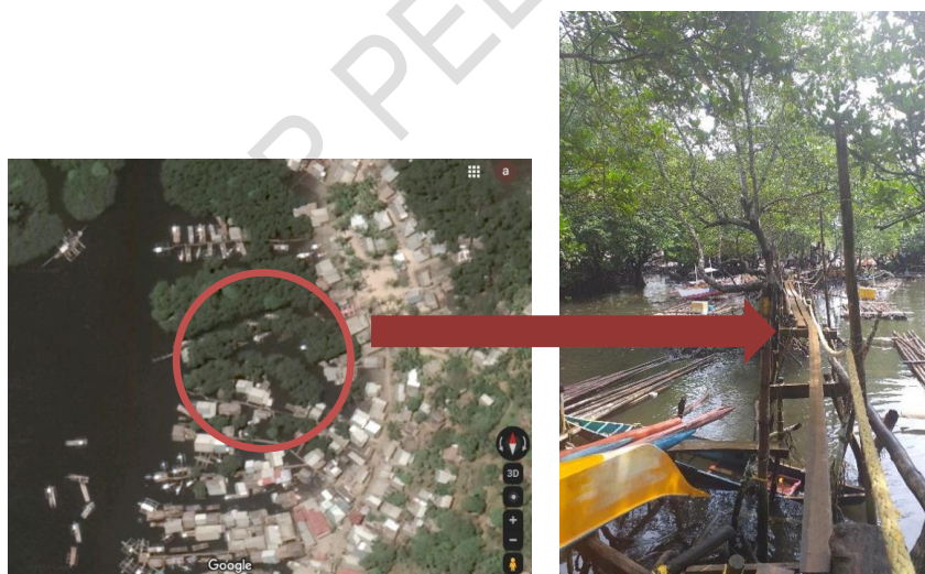
Figure 1. Rio Tuba and its coastal community (settlement area) location map

Along the coast of Rio Tuba resides a fishing community with houses built along the fringe mangrove forest. Coastal residential houses situated in the mangrove area directly dispose of domestic waste from kitchen refuse and toilets into the receiving coastal waters. The area is likewise utilized as a boat docking area where washing and flushing of oil-laden water are dumped.