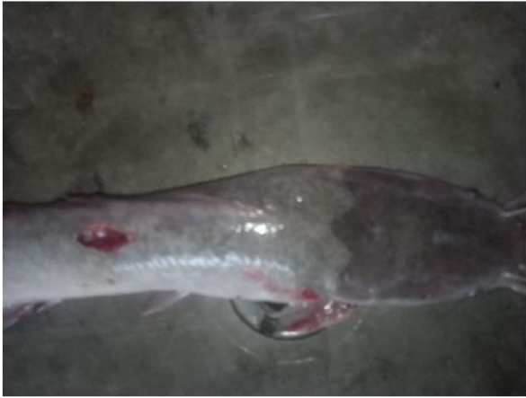
Figure 1: Fish Fed Do and Infected with K. pneumonia