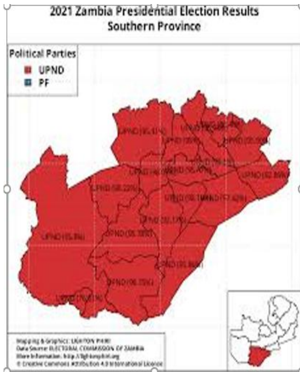
Figure 3 : 2021 Zambia presidential election results southern province

province of Zambia. Below is the map of the voting outcome in Southern Province: