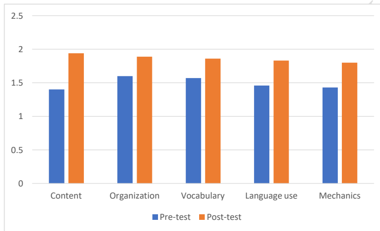
Figure 2. The mean score of student's five aspect writing ( experimental group)

This section is the summary of students' improvement in five aspects, including content, organization, vocabulary, language use, and mechanics: