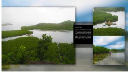
Figure 2 a : lalaguna mangrove eco-park

The effort did not end there. The island's rich Lalaguna mangrove eco-park, which puts the island in the map of stunning ecotourism destinations in the province, offers a great potential for future livelihood and ecotourism program of the community [1-3]. The site will be in the roster with the majestic rock formations of Biri Island in tour packages which are in the offing. Managed by the WAIID women, a pavilion built at the site caters to tourists; with a good provision of food and other amenities and a nice tour around the mangrove forest makes everyone feels nature at its best.