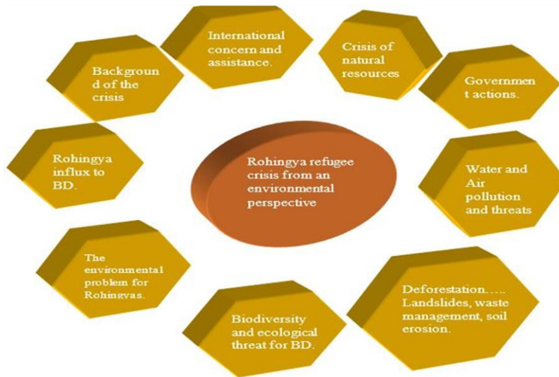
Figure 1: Concept Map

In this map, the complete focus of this study has mentioned. How the crisis has started and then the rapid influx of Rohingya into Bangladesh, crisis of resources, international concern, impacts on the environment, and government actions for environmental degradation have shown.