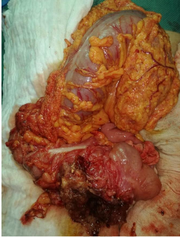
Figure 2: tumor mass of cecum