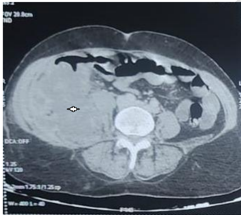
Figure 1: CT appearance of morol process of cecum

abscess of the right iliac muscle on the cecum's tumoral process. An emergency operation was performed on the patient. Surgical exploration revealed a burst retrocaecal appendix with mucus discharge in the retroperitoneal area, as well as a 4 cm thickening of the cecum's posterior side, which was non-stenosing and had an abscessed collection [Figure 2, Figure 3]. A right ileo-hemicolectomy was done, With an ileo-colic anastomosis. A mucinous adenocarcinoma of the appendix was discovered in the surgical material, which had permeated the whole caecal wall and reached the peritoneum. The recovery process was uncomplicated.