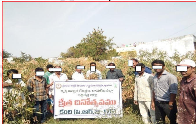
Fig. 4. Field day and Scientific Monitoring of farmers red gram fields