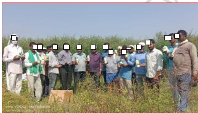
Fig. 1. Distribution of critical inputs (neem oil) to the farmers