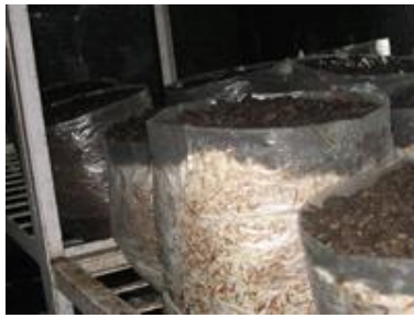
Fig. 2 Casing with black soil and farmyard manure

characteristics of the casing material like water holding capacity (%), bulk density ( \text{g}/\text{cm}^3 ), pH, EC ( \text{dS}/\text{m} ) and the texture of different casing materials were studied.