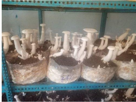
Fig. 3 Yield of milky mushroom