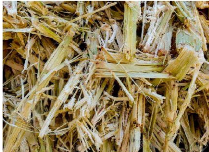
(b) Sugarcane bagasse

Comment [DN6]: As a result, the objectives of the study are to: evaluate the performance .....; assess the casing material.....; and analyze the cost economics of ..... Remove the heading 'OBJECTIVES'