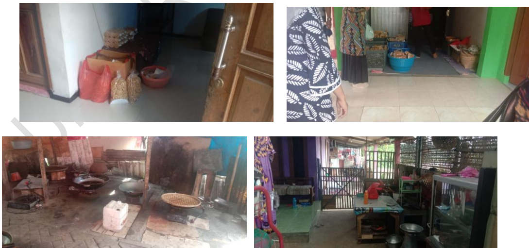
Fig. 4. Home Industry Keranggan Village

Figure 3 is a Homestay and Camping Ground which is one of the tourism programs in Ecotourism Village Keranggan. Homestay and Camping Ground are overnight tourism programs offered to tourists, while non-stay tourism programs are Home Industry tourism programs, as can be seen in Figure 4.