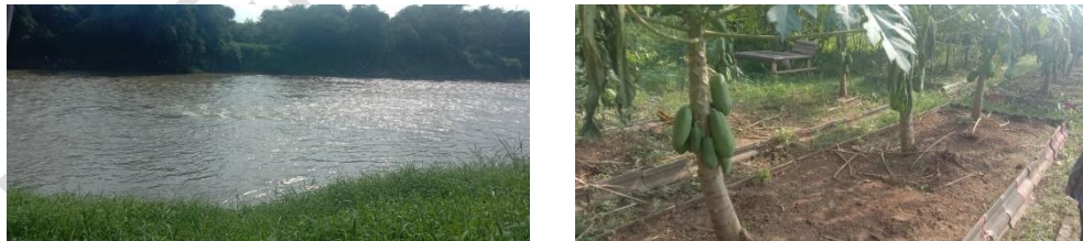
Fig. 2. Cisadane River and Pick Tour

From the results of observation and documentation techniques carried out by researchers, the attractiveness of Green Tourism in the Ecotourism area of Keranggan Village can be seen in Figure 2.