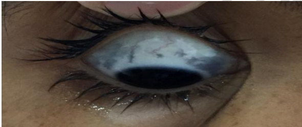
Figure 2 Eye movement without affecting the annexes