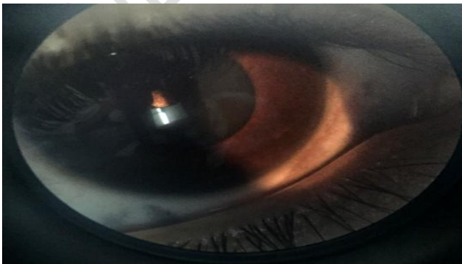
Figure 3 Iris nipples in the RE