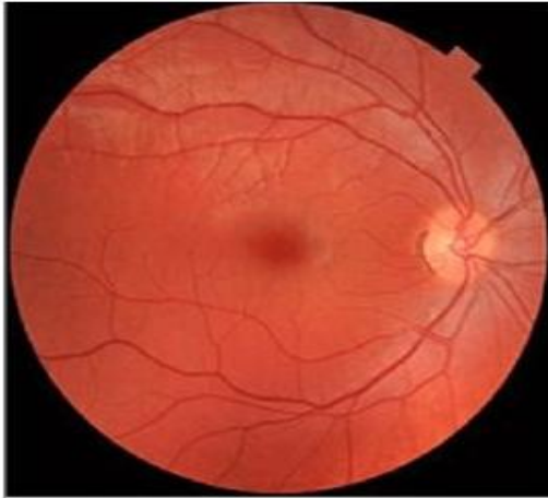
Right eye – normal fundus

normal fundus in right eye (RE) but left eye (LE) fundus showed myelinated nerve fibres, emerging from optic disc and present superior, inferior and temporal to optic disc. Nasal retina and macula were free from myelination. Macula was normal (Foveal reflex seen). Optic disc showed a cup-disc ratio (C:D) of 0.4. A-Scan biometry done by immersion technique revealed axial length of : LE – 20mm and RE – 23mm.