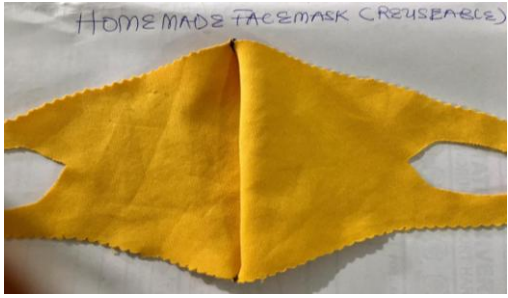
Fig. 3 Factory made Reusable face mask (inner surface)