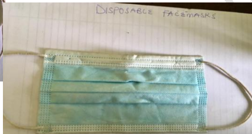
Fig. 6 Factory made Disposable face mask (Outer surface)