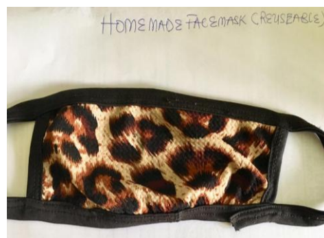
Fig. 2 Home made Reusable face mask (Outer surface)