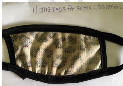
Fig. 1 Home made Reusable face mask (inner surface)

A total of Twenty-Five (25) used facemasks which comprises of homemade face masks and surgical masks were collected aseptically from the school children (exchanged with new ones), the used facemasks was taken and carefully put in a sterile container and transported to the laboratory.