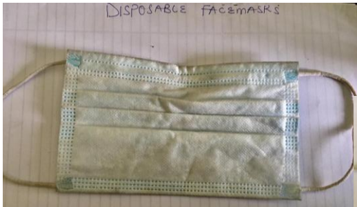
Fig. 5 Factory made Disposable face mask (inner surface)