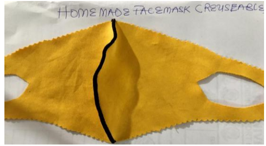
Fig. 4 Factory made Reusable face mask (Outer surface)