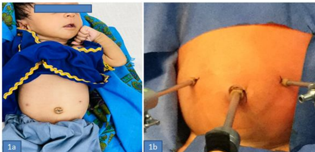
Figure 1a: 03 laparoscopic ports 1b: minimal post operative port marks

patients. 2. Ultrasound guided infiltration and deposition of xylocaine mixed with adrenaline dose not exceeding more than 7mg/kg block given immediately after Induction of general Anesthesia by using 0.5% lidocaine with adrenaline at the dose of 7mg per kg in every patient . OT temperature was maintained at 34°C. Neonatal Infant Pain Scale (NIPS) was used to measure the postoperative pain.