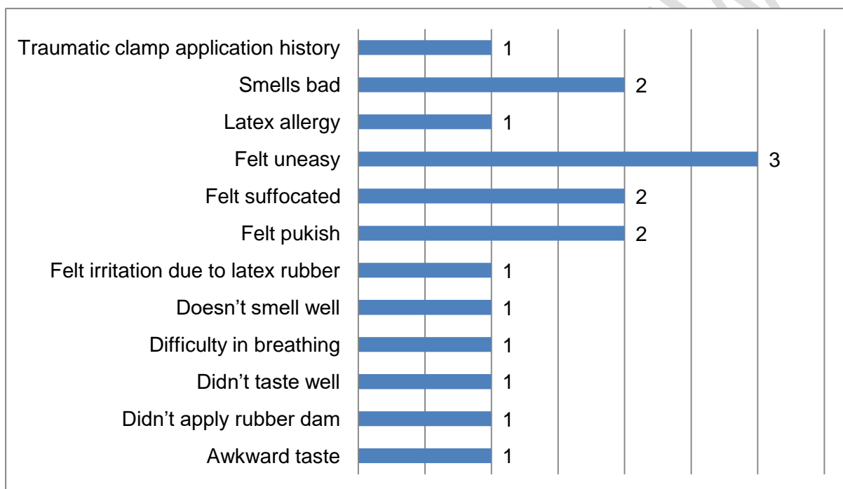
Figure III: Reasons of rejection(as per patient's response)