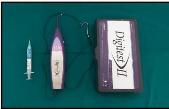
Figure 2 Electric Pulp Tester (Digitest II) and EDTA

Because ropivacaine is not accessible in dental cartridges, 10-mL vials were used. Under sterile conditions, 1.8 mL of 0.2% ropivacaine was drawn from the original (NOVAPLUS; SAGENT PHARMACEUTICALS Schaumburg, IL 60195, USA) vial into a sterile syringe using a 0.4 · 19 mm needle. Each vial was used only once. 4% Articaine (Dentsply, Canada) was administered from dental cartridges using a 0.4 · 21 mm needle. In the region of right or left central incisor root apex in the buccal surface, 1.8 mL of the anaesthetic solution was administered (a standard maxillary infiltration injection). After aspiration, the solution deposited over a 30-s period. Blood pressure, pulse and Oxygen saturation measured after immediate administration of the local anaesthetic. The examination was terminated for each tooth when the patient responded to two consecutive stimulations (60 mA) of the central incisor. At last blood pressure, pulse and oxygen saturation at the end of examination. Recorded data was sent to Statesian for analysis.