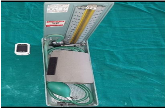
Figure 1 Image showing Pulse oximeter and Sphygmomanometer.