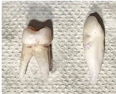
Figure 2 shows a newly extracted natural tooth that was exposed to an OP compound solution for an hour. The cervical region and the apical 1/3rd of the tooth have a slight purplish tint.

Visual changes: Very mild color changes were observed in the cervical region and the apical 1/3rd of the tooth after an hour. Visually or physically the tooth's structure and morphology have not been altered except for the color (figure 2).