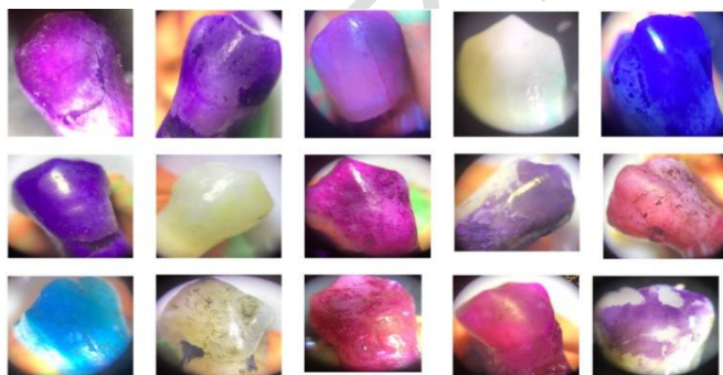
Fig2- picture represents the Amelographic patterns on staining the labial surface of maxillary premolars using 15 different stains by soak method and studied under a stereo microscope.