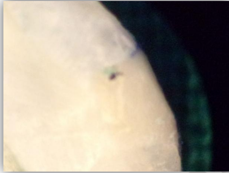
Figure 3b: Stereomicroscope images showing microleakage of score 2