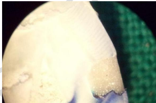
Figure 3c: Stereomicroscope images showing microleakage of score 3