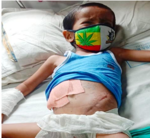
Fig 1. Patient with symptoms

Family History: - In my patient There are three members in the family. my patient was diagnosed to have Hirschsprungs disease, and his parents are healthy and he his belongs to nuclear family. all other member of the family is healthy were not having any other complaints in their health except my patients who was being admitted in the hospital at AVBRH.