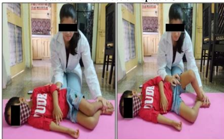
Figure 3: Pelvic stabilization exercises (Starting and end position for clam)