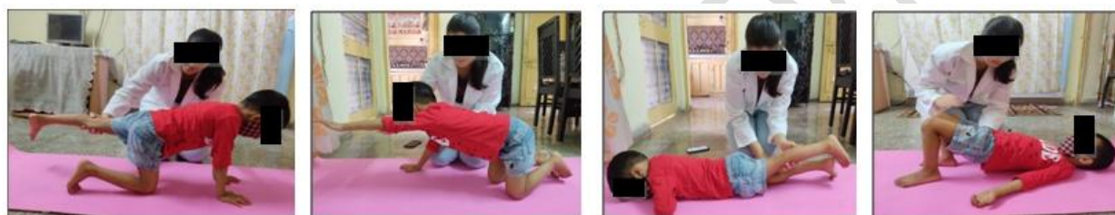
Figure 4: Pelvic stabilization exercises (Leg lift tabletop, tabletop arm lift, leg lift and Bridging exercise)